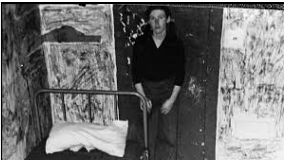
Republican POW no wash protest, Armagh Gaol.

Beir bua, ní saoirse go saoirse na mban!